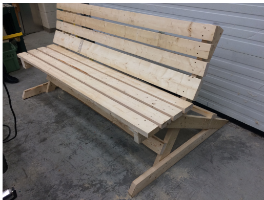
Student designed & built bench