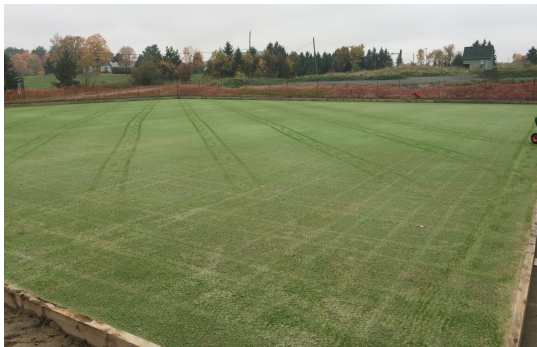
Newly sprouted grass

As I am sure you have read in the media, our new lawn bowling green has finally been built! We have been working on this project since at least 2010. Thanks to a $150,000 grant from the Ontario Trillium Foundation, the construction got underway in August 2016 on land generously provided by the Muskoka Highlands Golf Course. Construction was completed in late September. The grass seed has sprouted, and we hope to open for play by July 2017. A grand opening ceremony is already being planned!